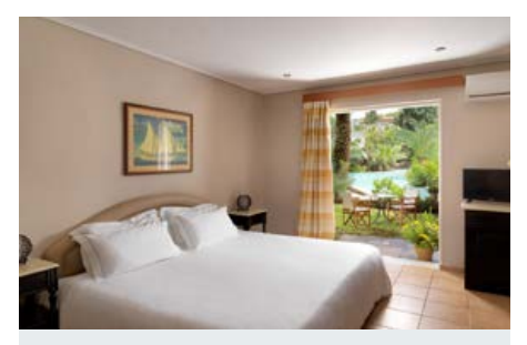
Classic Double Room Garden View