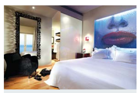
Lifestyle One-Bedroom Suite