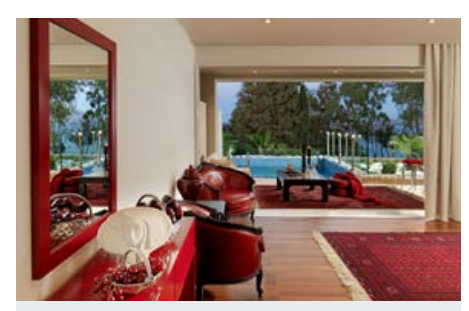
Exclusive Junior Suite with Private Jacuzzi or Pool