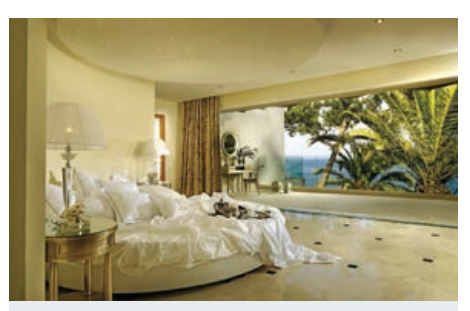
Emerald Four-Bedroom Villa with Private Pool