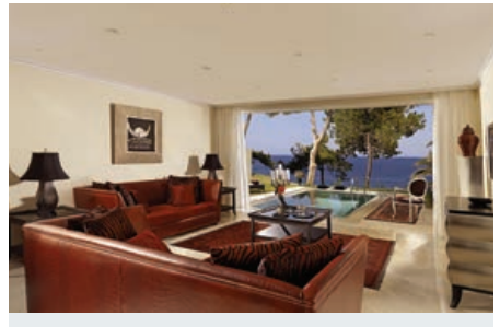
Exclusive Seafront One-Bedroom Maisonette Individual Pool