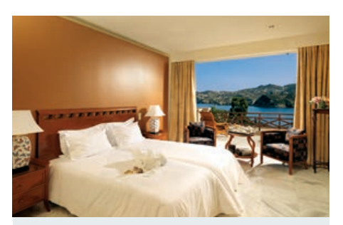
Classic Double Room Sea View